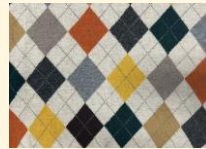
Gray Beige “A” (7A)