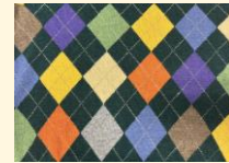
Dark Green (57)