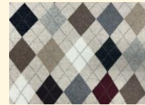
Gray Beige “B” (7B)